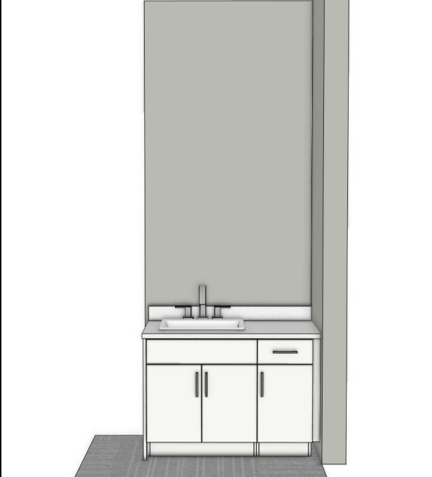
Main floor vanity